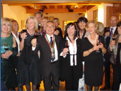
During the evening all of them brought a very nice song which reflected this togetherness.

41 Club Italy has been working closely with Agora Italy and were represented with a very nice delegation. "4 Clubs-1Vision" is a fact in Italy and they are really working side by side in the best interest of our associations.